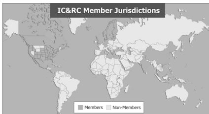
IC&RC represents more than 45,000 addiction-related professionals from 76 Member Boards.